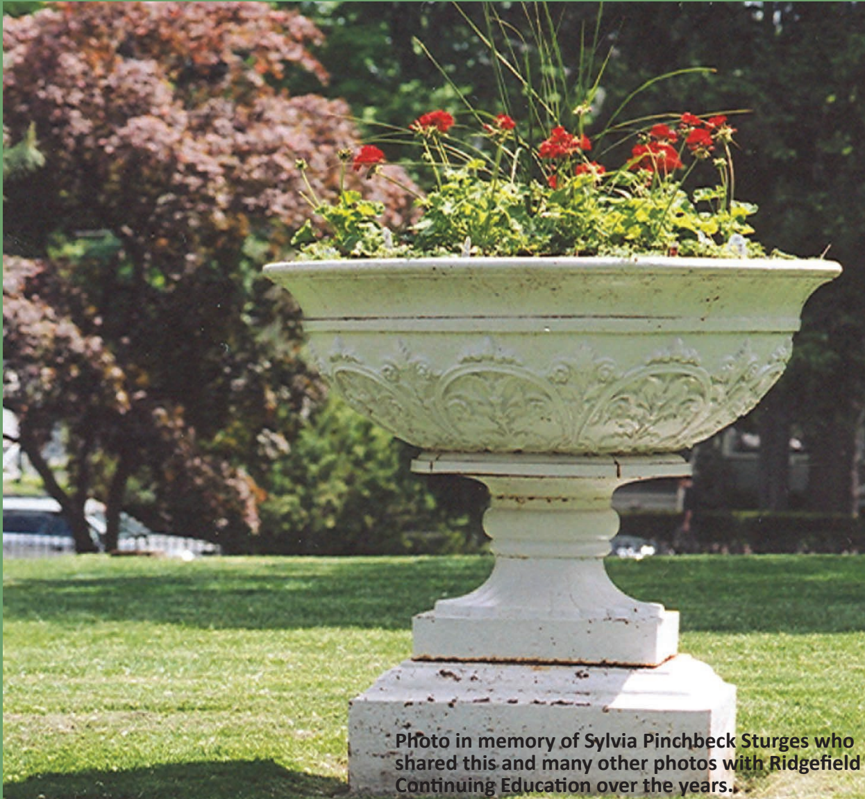
Photo in memory of Sylvia Pinchbeck Sturges who shared this and many other photos with Ridgefield Continuing Education over the years.

Courses Start on a Rolling Basis ~ Spring into Summer 2024